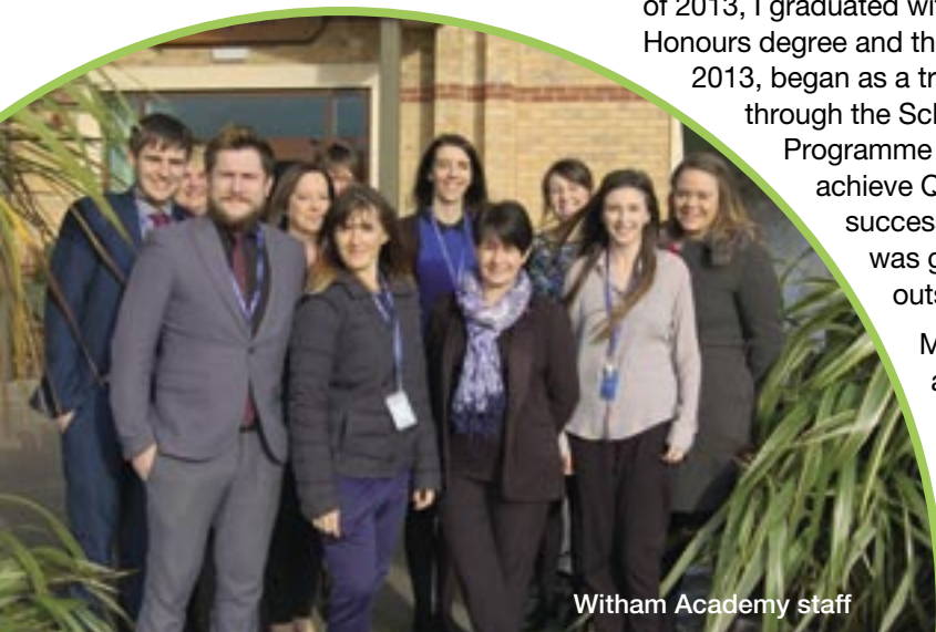
Witham Academy staff

"While completing my degree, the Curriculum Leader of ICT position became available for which I was the successful candidate. I qualified as a teacher in 2011, and in 2014 became a Year Director."